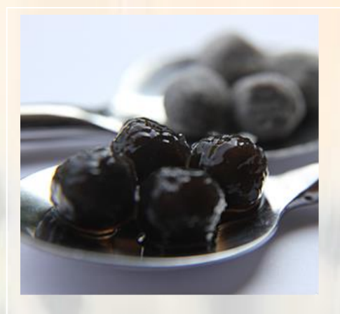
Sweet tapioca balls.