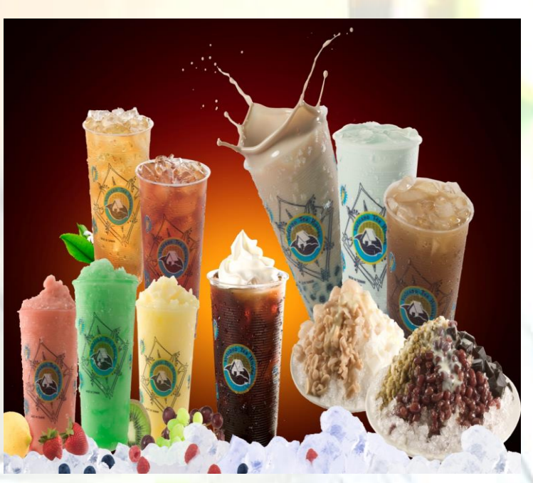
Prices and items are subject to change