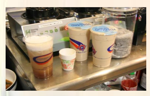
Drinks ready to be served