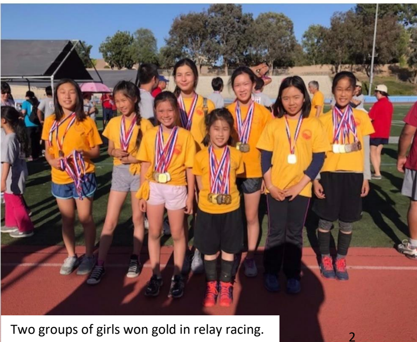
Two groups of girls won gold in relay racing.